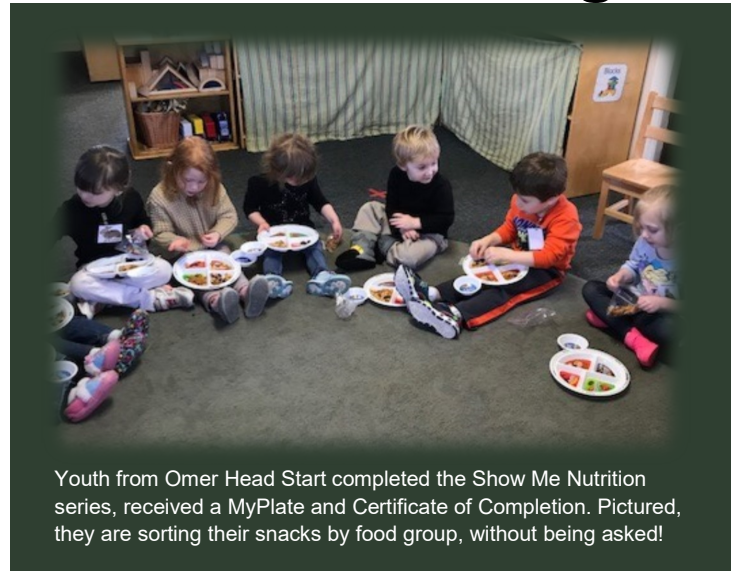
Youth from Omer Head Start completed the Show Me Nutrition series, received a MyPlate and Certificate of Completion. Pictured, they are sorting their snacks by food group, without being asked!

In addition to SNAP-Ed, food preservation classes such as canning, pickling, etc., along with food safety have been successfully conducted in Arenac County.