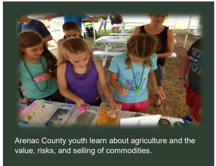
Arenac County youth learn about agriculture and the value, risks, and selling of commodities.

4-H is a program of Michigan State University Extension. In 2018, 203,000 Michigan youth participated in 4-H through various activities, clubs, groups, programs and events. As they engage in these learning experiences, 4-H'ers explore their passions and interests while growing confidence, leadership skills and a sense of responsibility. Throughout 2018, there were 277 youth reached via school enrichment, 242 youth in project clubs, 328 reached by Short Term/Special Interest programs and 19 overnight campers. With duplicates removed, the total number of youth served in Arenac County (across all programs) was 677.