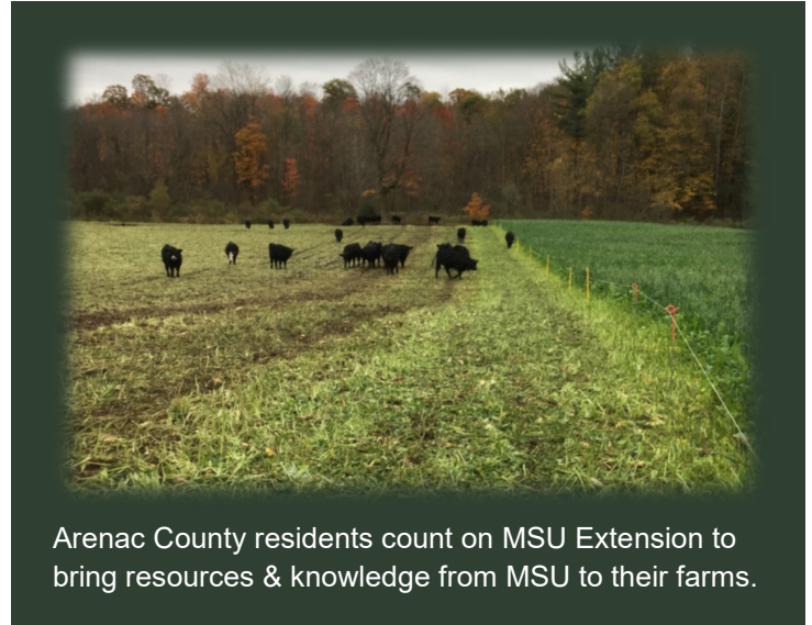
Arenac County residents count on MSU Extension to bring resources & knowledge from MSU to their farms.

In October of 2018, 27 people attended the Cover Crop Field Event held at Schwab Farms in Standish, Michigan.