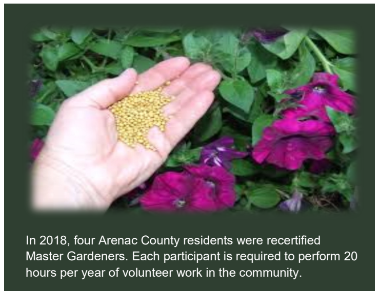
In 2018, four Arenac County residents were recertified Master Gardeners. Each participant is required to perform 20 hours per year of volunteer work in the community.

When residents have insect questions, soil concerns, gardening challenges or shrub questions, they count on MSU Extension to assist. 23 Arenac County residents purchased soil test kits this past year. Residents have often bundled bugs in a bag and walked in to the office for help. MSU Extension also offers a Smart Gardening hotline (7,707 calls in 2018!) at 1-888-MSUE-4MI. Our advice is based on science performed at Michigan State University or other land grant universities.