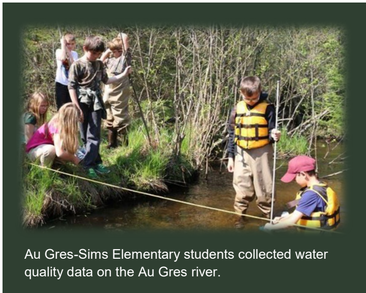
Au Gres-Sims Elementary students collected water quality data on the Au Gres river.

In 2018, MSU Extension and Michigan Sea Grant continued to support place-based education efforts with Au Gres-Sims School District through the Northeast Michigan Great Lakes Stewardship Initiative. These efforts include river investigations and water quality monitoring, biodiversity studies at Big Charity Island, and rain gardens to reduce nonpoint source pollution. Through place-based education, students apply their learning to benefit their community and protect the Great Lakes. They also explore careers while working with community partners. This learning strategy is hands-on and fun!