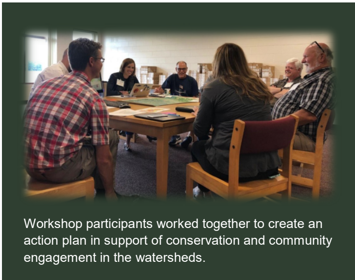
Workshop participants worked together to create an action plan in support of conservation and community engagement in the watersheds.

In 2018, MSU Extension, Michigan Sea Grant and Huron Pines collaborated with Purdue University Extension and the Illinois-Indiana Sea Grant to host a Tipping Point Planner Workshop for the Au Gres Watershed. This workshop focused on land use, nutrients, water quality, outdoor recreation and the Saginaw Bay food web in the Au Gres River Watershed (and East Branch). Participants received a report, which was generated as a result of the workshop, to help support future planning efforts in the Au Gres River Watershed.